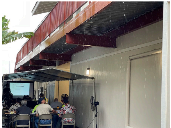
It rained on Sunday morning