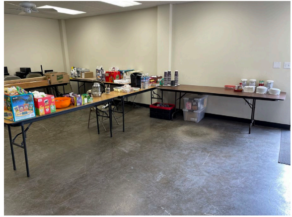
Food and beverage area