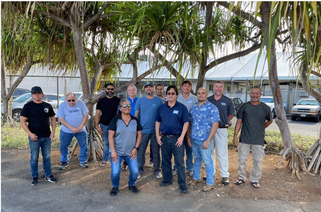
Quality Control Manager Program – Attendees and Instructors