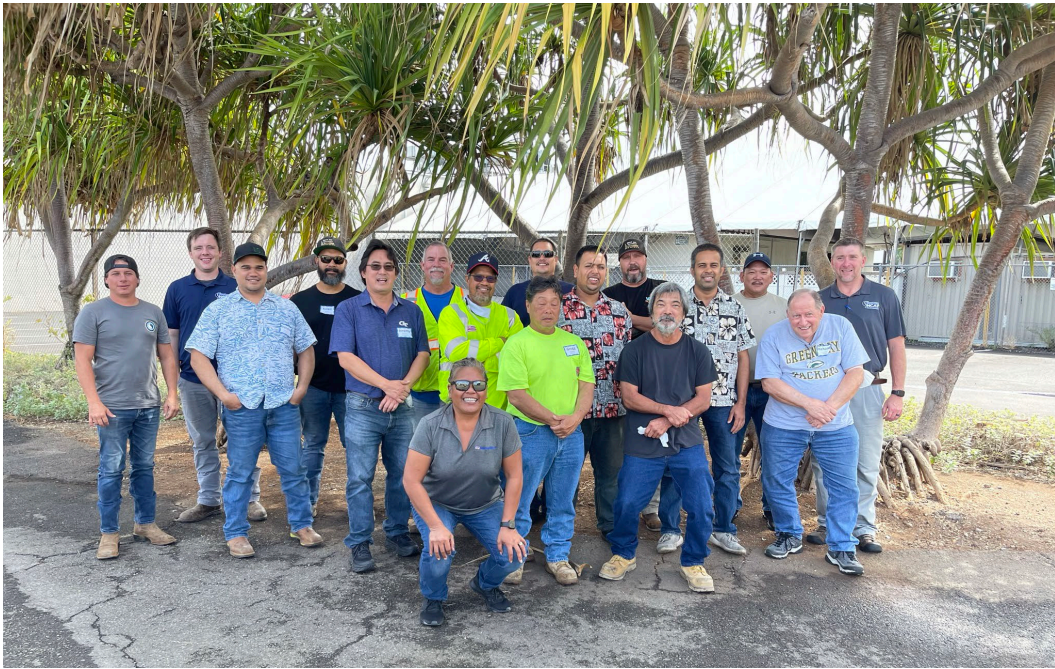
Asphalt Lab Technician Program – Attendees and Instructors