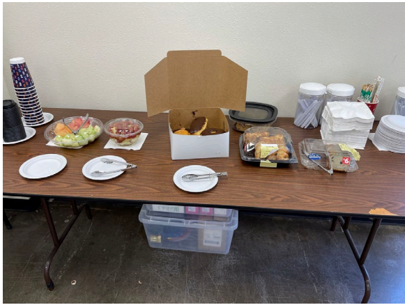
Starting the day off . . .